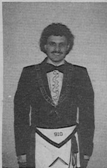
THE SINGING MASTER

Each Master of a lodge has their own individual characteristics and strong points. Flower City's Master likes to sing for his supper. And, by the reaction of members and guests, he doesn't do a bad job. And as promised the installations were well attended and enjoyed.